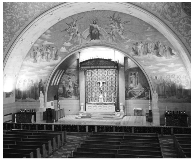
St. Brigid, Detroit