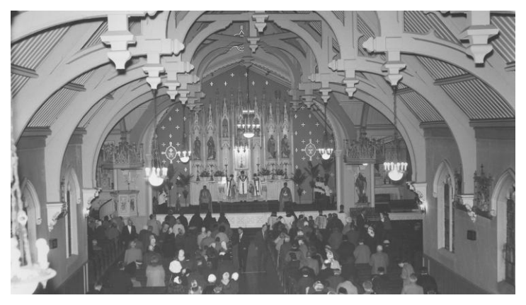
St. Martin of Tours Detroit